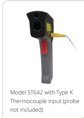
Model ST642 with Type K Thermocouple input (probe not included)